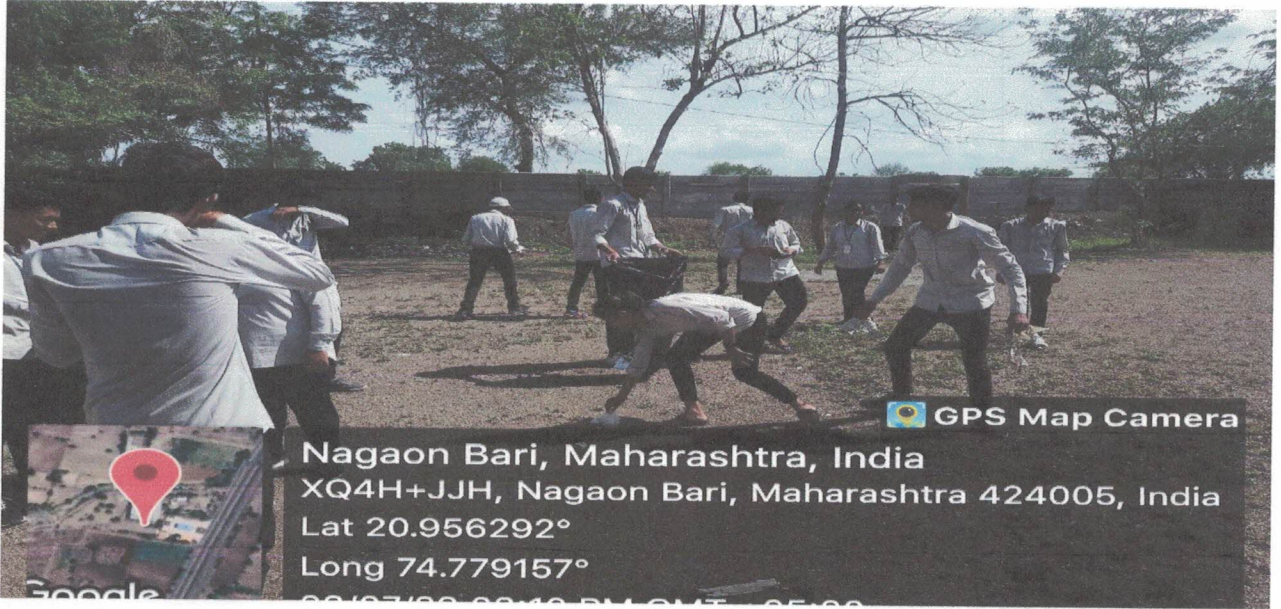
Swaccha bharat abhiyan activity in college campus (27/02/2022)

Swach Bharat Abhiyan activity was undertaken from February 2017 till today where in campus cleanliness activity should be carried out or to get the better ideas of cleanliness we are organized the activity with the help of Zila Parishab Nimdale school of Nimdale village