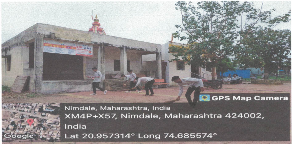
Swacha Bharat Abhiyan activity at Nimdale Village 18/06/2019