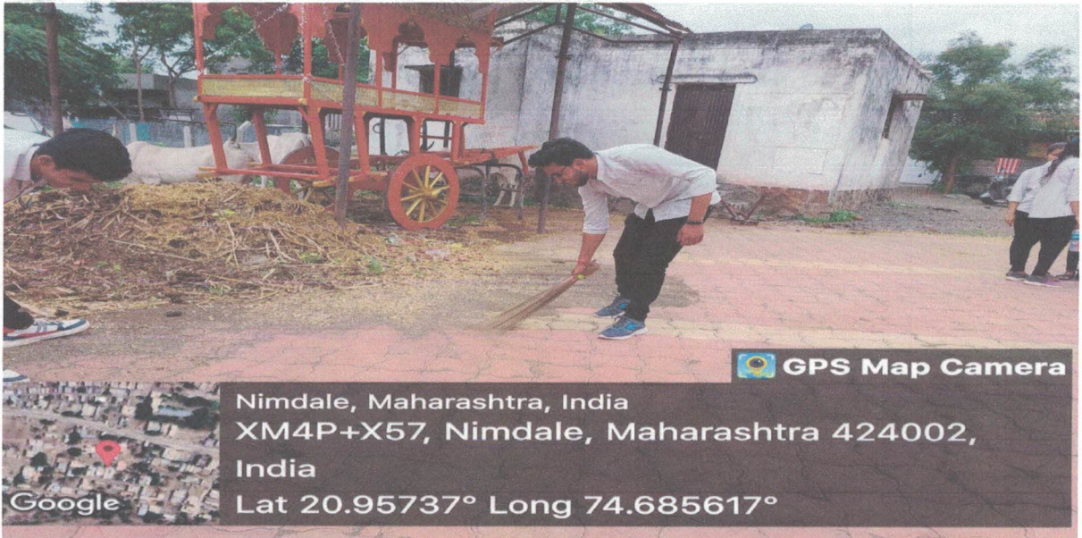
Swacha Bharat Abhiyan activity at Nimdale Village 12/05/2018